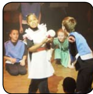
The Victoria Hall group

Following the success of 'Fright Fest' which was the final culmination of Youth Operatunity (our year long programme working with young people to devise their own piece of music theatre), New Vic Borderlines and The Victoria Hall & The Regent Theatre are planning to continue to support the young people who wish to continue to develop their vocal and acting skills.